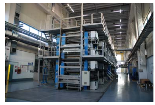
WIFAG pressline at CSQ

For more information: <a href="https://www.qipc.com">www.qipc.com</a>