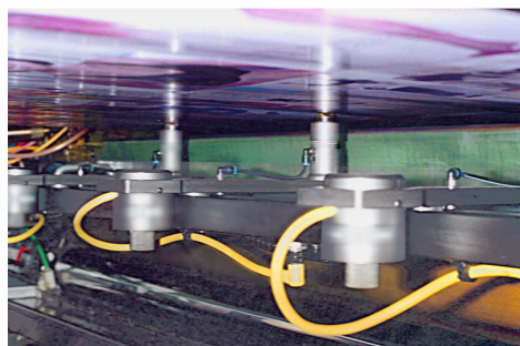
ABD register-nozzle bar stretching the web width by non-contact air pressure

Giffin Graphis, Q.I. Press Controls' agent for the Middle East build a good relation with Jordan Press Foundation during earlier IRS colour register sales and services. Giffin also confirms to be extremely happy that Q.I. Press Controls' latest m RC+ technology with micro-marks now is selected in combination with Q.I. Press Controls' worldwide proven ABD Fan-out register-technology: 'ABD operates much faster and continuously more accurate than any printing crew can perform. So after press-commissioning readers and advertisers will profit from the Commander's constant top-register printed fullcolour quality. Pay-off from this large investment in print quality-improvement will come from a three-fold reduction: in setup-time, material and crew'.