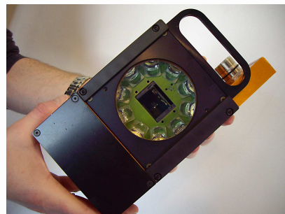
West Ferry Printers' CT-Commander printquality will rely on Q.I. Press Controls' widely proven m RC+ cameras.

Express Newspapers Group, is to move its subsidiary West Ferry Printers London from its Docklands, home of the past 24 years, into a new as yet unnamed site, possibly to the north of London. Alongside Express Newspapers Group titles – the 'Daily Express' and 'Sunday Express, the 'Daily Star' and 'Daily Star Sunday' – the Commander CT presses will also print contract work, including the 'Daily Sport'. Idle time will be used for semi-commercial work which will also enable the group's magazines to be printed in-house.