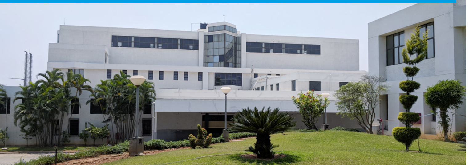
The Printers Mysore headquarters in Bengaluru.