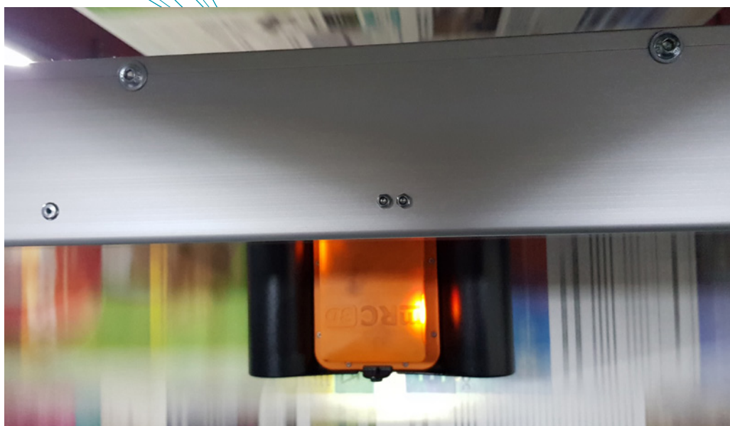
mRC-3D in action on the Heidelberg/Harris Mercury press at Drukkerij Uitgeverij van Barneveld in Denekamp.

"I can't actually imagine other printers not using press automation systems"