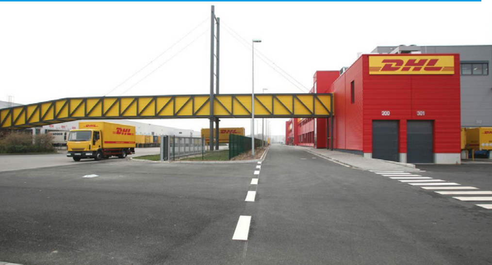
Exterior view of the DHL logistics center in Greven, Germany.

"The most difficult challenge with this project lay in integrating the large number of different modules such as conveyor drives, carton erectors, inkjet units, light barriers, barcode scanners, labelers, etc. A lot of engineering effort was called for to make sure all components dovetail