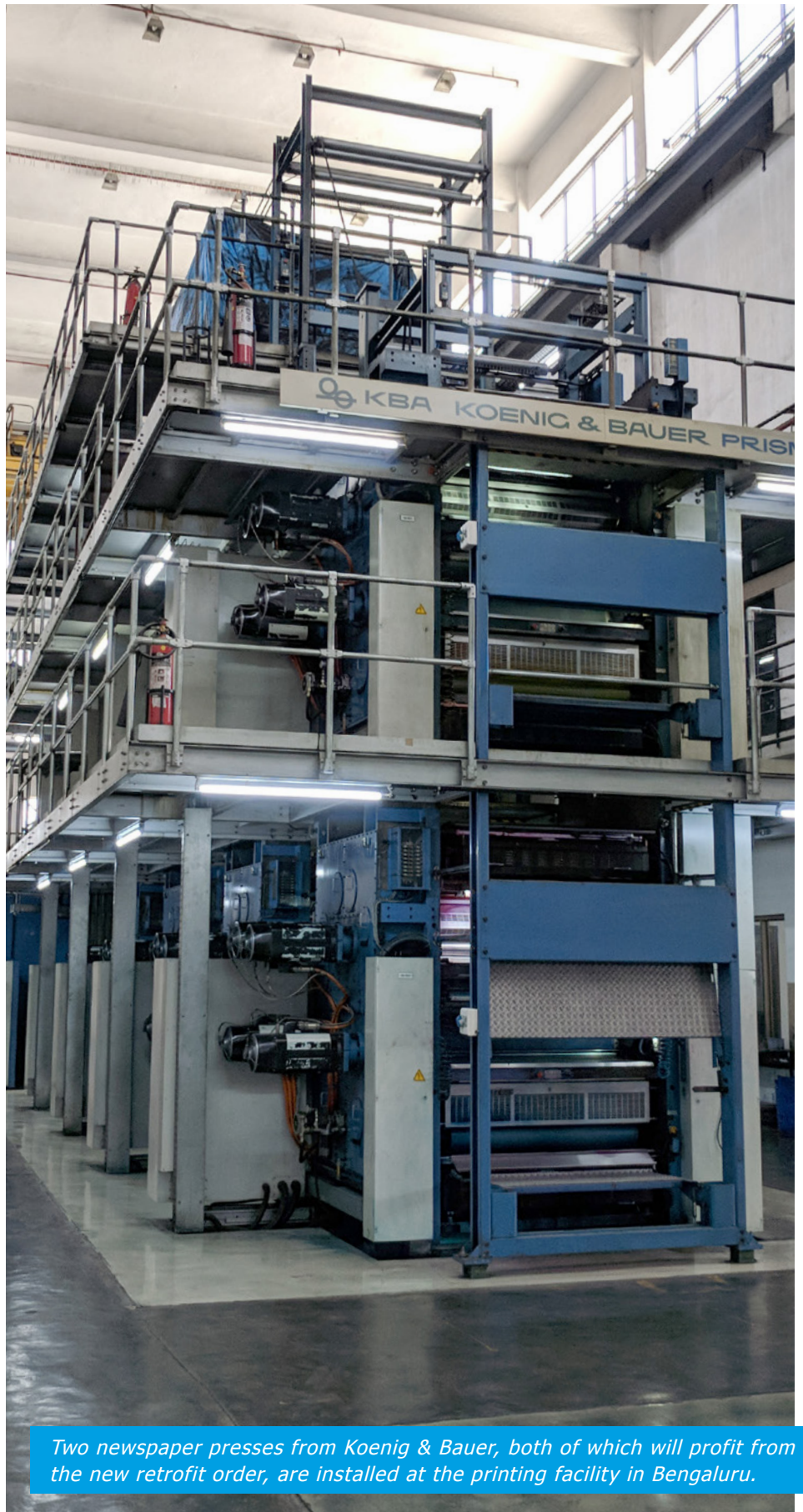
Two newspaper presses from Koenig & Bauer, both of which will profit from the new retrofit order, are installed at the printing facility in Bengaluru.

A special team of experts from QIPC – EAE India will take care of the installation and commissioning of the new PC hardware for the EAE systems. And incidentally, like EAE's other customers in the Indian newspaper market, The Printers Mysore will continue to profit from QIPC – EAE India's competent local service and support long after the installation phase is completed.