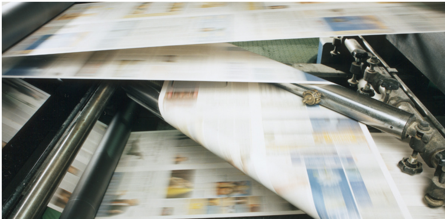
Production at Mediaprint takes place at three printing centres on a total of 13 KBA Commander web presses, which will be being modernised as part of a major retrofit project.