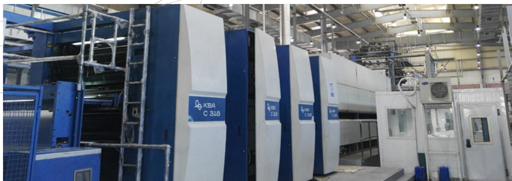
KBA Compacta 318 press on which the QIPC systems are installed.