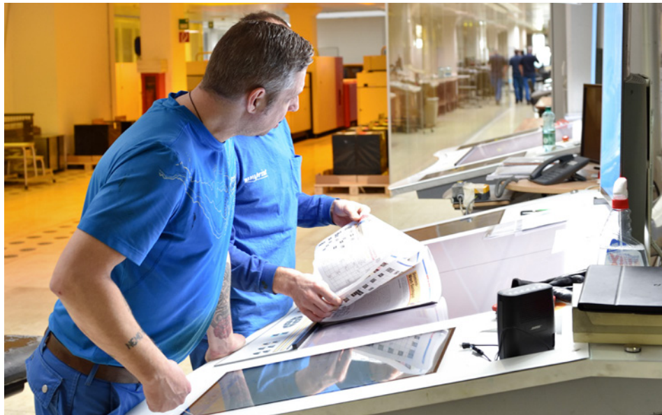
Two new EAE Desk 7 control consoles – the first of their kind in the world – are already in operation at the Vienna printing centre.